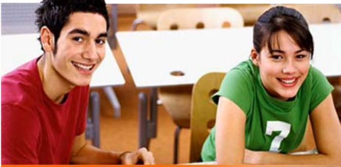
The Project Spera Quarterly Newsletter