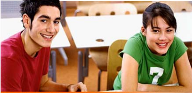
The Project Spera Quarterly Newsletter